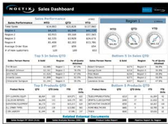
Sales Dashboard — Includes sales by region by period, number of new customers, average order size and top/bottom 5 sales, top/bottom 5 products

The solution provides financial intelligence information presented in interactive graphical reports. Using NoetixViews for Oracle E-Business Suite, transaction data is easily extracted, analyzed and presented in a variety of formats.